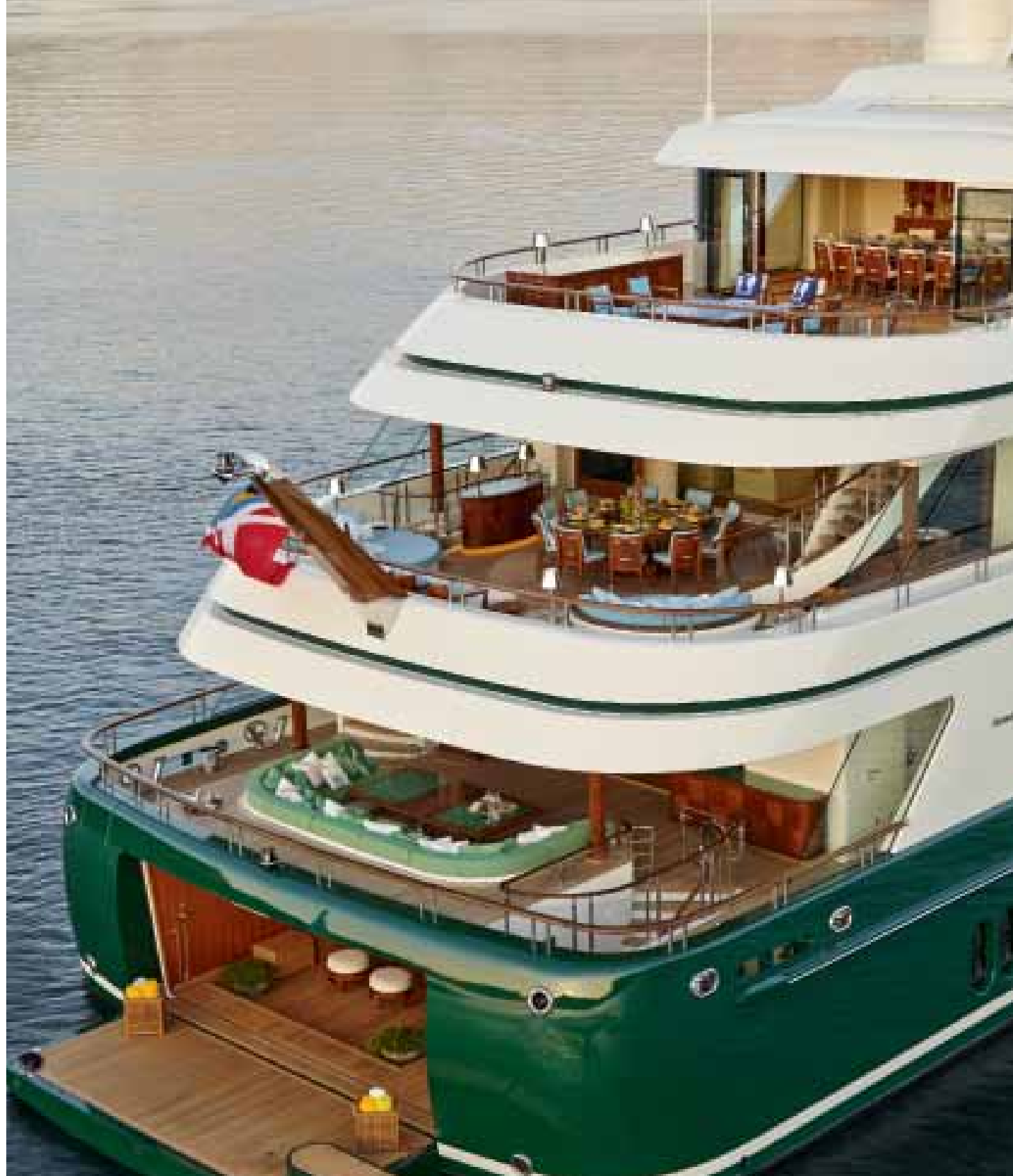
SEA OWL Feadship

LOA 62m LWL 54.2m Beam 12.2m Draught 3.7m Engines 2 x MTU 16V 4000 M53R, 2,038hp