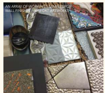
AN ARRAY OF WORKINGS SAMPLES FOR WALL FINISHES FROM DKT ARTWORKS

The company's designs can be seen in super yachts, many fashionable restaurants throughout London, for example Nobu and The Wolseley, as well as hotels, such as The Langham Hotel and The Berkeley Hotel, and many private institutions and banks. m.jbradforddavis.com