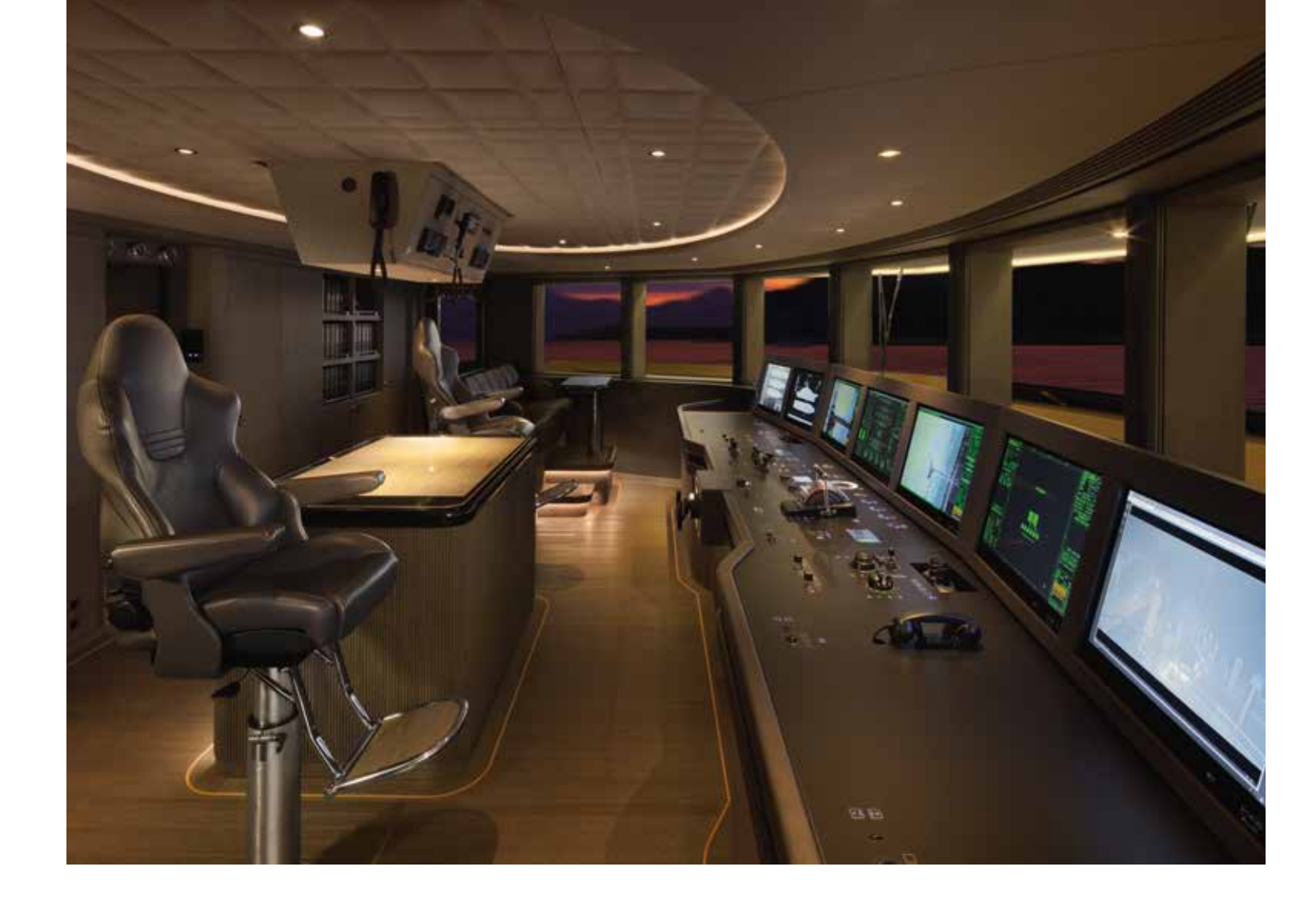
Above: the lavishly appointed wheelhouse. Below: the aft decks benefit from generous overhangs and offer a variety of spaces to be enjoyed by separate groups of guests