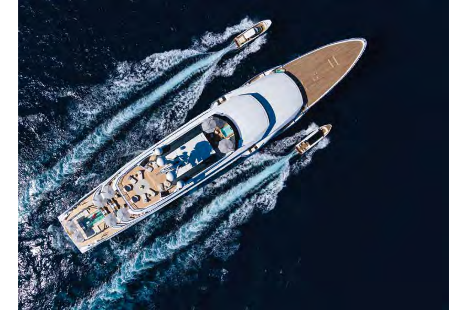
\label{lines} \textit{DreAMBoat has a 6m x 3.1m pool on the main aft deck and a further (large) spa pool on the sundeck. \textit{@ino's superstructure is notable for its distinctive chamfers and knuckle lines}