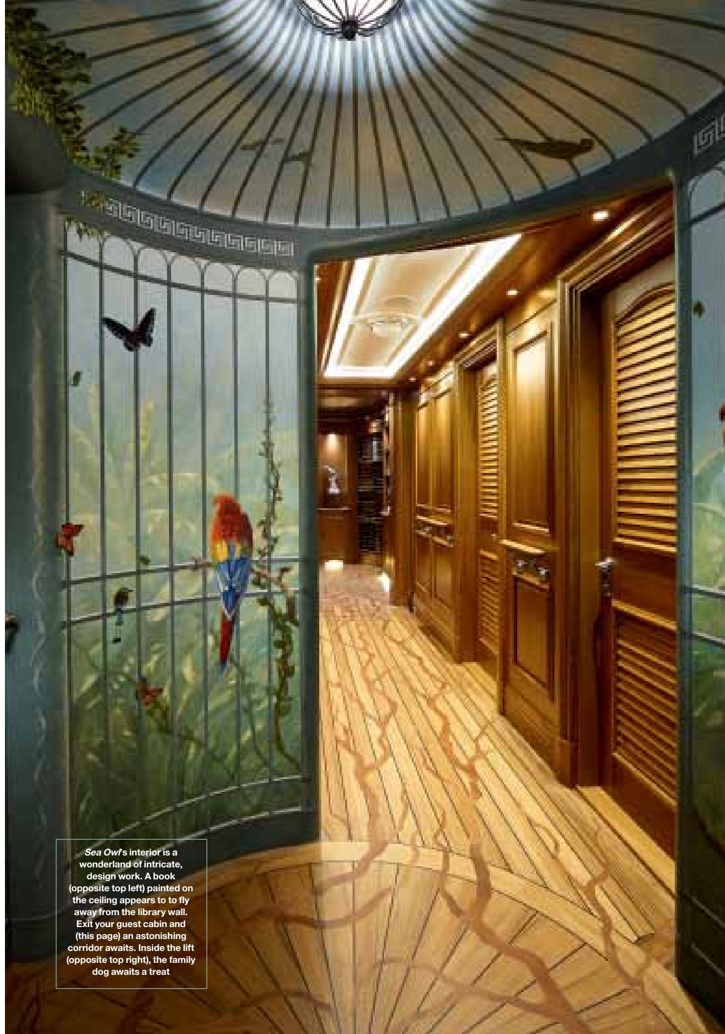
Sea Owl's interior is a wonderland of intricate design work. A book (opposite top left) painted on the ceiling appears to fly away from the library wall. Exit your guest cabin and (this page) an astonishing corridor awaits. Inside the lift (opposite top right), the family dog awaits a treat